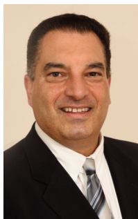
New York Law Journal Rankings

The two primary Resolute panelists available at this location: